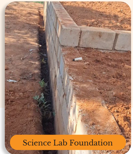
Science Lab Foundation