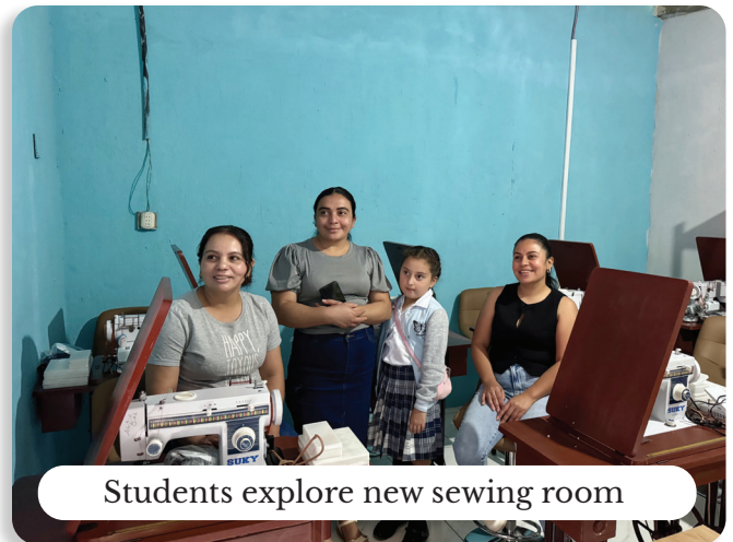
Students explore new sewing room